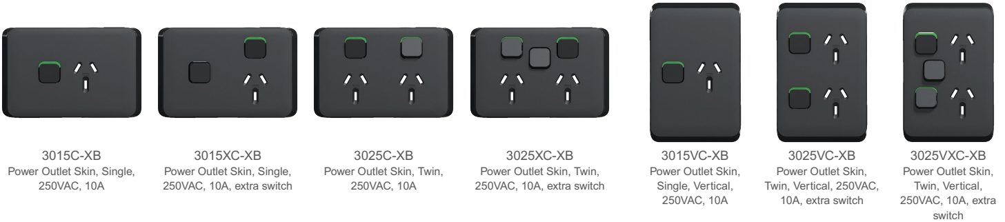
3015C-XB Power Outlet Skin, Single, 250VAC, 10A 3015XC-XB Power Outlet Skin, Single, 250VAC, 10A, extra switch 3025C-XB Power Outlet Skin, Twin, 250VAC, 10A 3025XC-XB Power Outlet Skin, Twin, 250VAC, 10A, extra switch 3015VC-XB Power Outlet Skin, Single, Vertical, 250VAC, 10A 3025VC-XB Power Outlet Skin, Twin, Vertical, 250VAC, 10A, extra switch 3025VXC-XB Power Outlet Skin, Twin, Vertical, 250VAC, 10A, extra switch