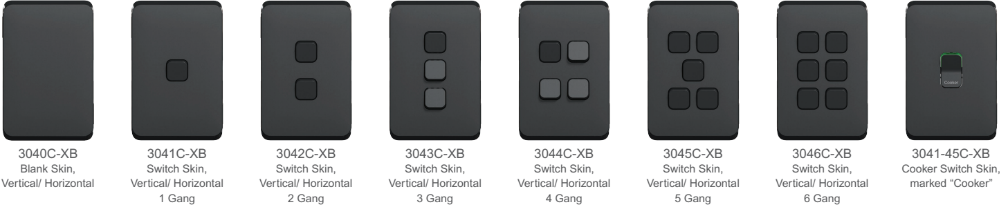
3040C-XB Blank Skin, Vertical/ Horizontal 3041C-XB Switch Skin, Vertical/ Horizontal 1 Gang 3042C-XB Switch Skin, Vertical/ Horizontal 2 Gang 3043C-XB Switch Skin, Vertical/ Horizontal 3 Gang 3044C-XB Switch Skin, Vertical/ Horizontal 4 Gang 3045C-XB Switch Skin, Vertical/ Horizontal 5 Gang 3046C-XB Switch Skin, Vertical/ Horizontal 6 Gang 3041-45C-XB Cooker Switch Skin, marked "Cooker"