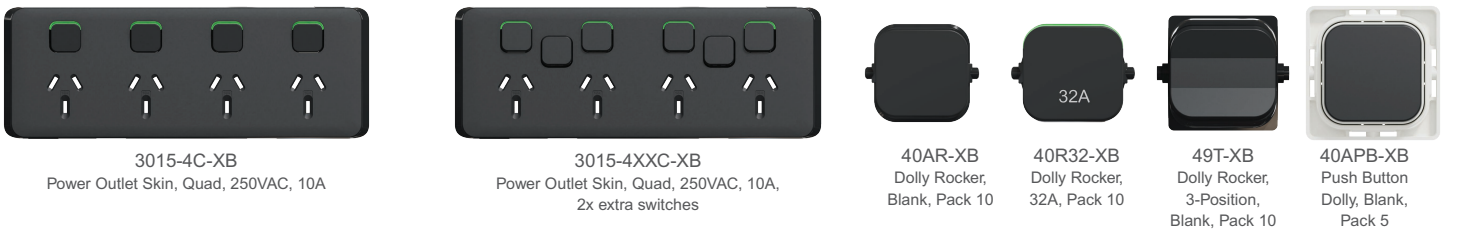
3015-4C-XB Power Outlet Skin, Quad, 250VAC, 10A 3015-4XXC-XB Power Outlet Skin, Quad, 250VAC, 10A, 2x extra switches 40AR-XB Dolly Rocker, Blank, Pack 10 40R32-XB Dolly Rocker, 32A, Pack 10 49T-XB Dolly Rocker, 3-Position, Blank, Pack 10 40APB-XB Push Button Dolly, Blank, Pack 5