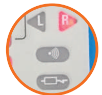
Rotary Field Indication, Continuity & Low Impedance