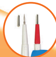
4mm Screw on Probe Tip Extension