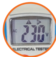
2000 Count Backlit LCD Display