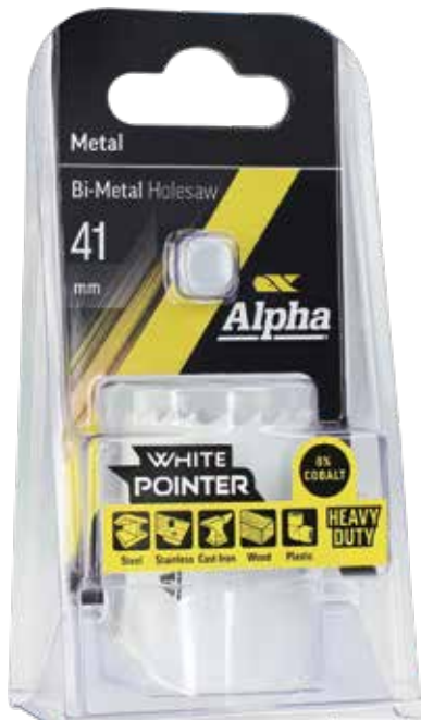
CARDED - 1 PCE Supplied in hangable or free-standing card